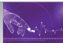
Inflammatory skin diseases