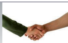
Life Science Venture Capital