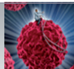
New Wave Innovations in Vaccines