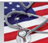
Keynote Drug Pricing and Trump Administration