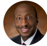
Albert Bourla Chairman and CEO, Pfizer

"Merck's mission is to translate science into medically important products that positively impact humanity, so it is natural for us to support the Prix Galien, since it supports exactly that."