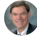
Kenneth C. Frazier Chairman, Former CEO and President, Merck

"The Galien Foundation brings together the top scientists in the world. You have Nobel Laureates across the spectrum of scientific disciplines meeting and talking with members of the pharmaceutical industry to see what's going on at the cutting edge, because ultimately that's going to benefit patients."