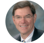
Kenneth C. Frazier Chairman, Former CEO and President, Merck

"The Galien Foundation brings together the top scientists in the world. You have Nobel Laureates across the spectrum of scientific disciplines meeting and talking with members of the pharmaceutical industry to see what's going on at the cutting edge, because ultimately that's going to benefit patients."