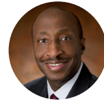
Albert Bourla Chairman and CEO, Pfizer

"Merck's mission is to translate science into medically important products that positively impact humanity, so it is natural for us to support the Prix Galien, since it supports exactly that."